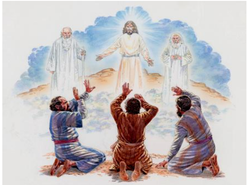
THE DEEP END: The Mountain Top

'All services broadcast from Holy Cross Church. It can only be tuned in when a service is on.'