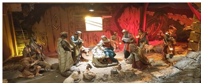
'Our Christmas Crib'

With the holy season of Christmas now at an end, our beautiful Crib will be removed this Sunday. The priceless figures dating back to 1880 will once again be cleaned, covered and stored away in their press, for yet another year.